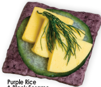
Purple Rice & Black Sesame